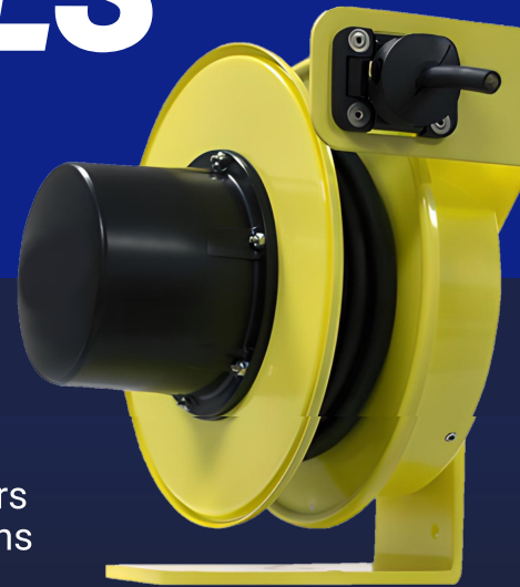
Lift / Drag Cable Reel

The 1400 Series Cable Reel will give you years of service in demanding industrial applications with little to no maintenance! These reels feature rugged all-steel construction with safety chain hole for overhead-mounted reels. PowerReels are also outfitted with precision built main springs housed in a safety sealed canister